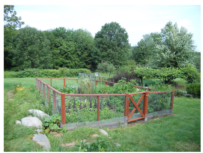
Summer View from Apartment.