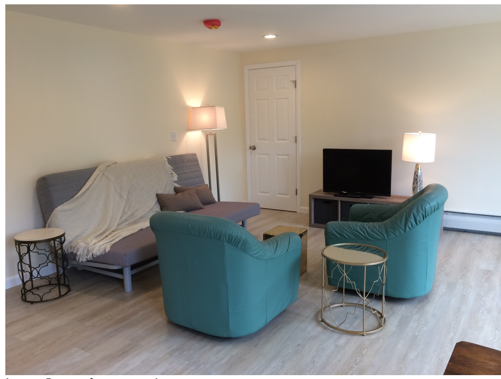
Living Room facing southeast.