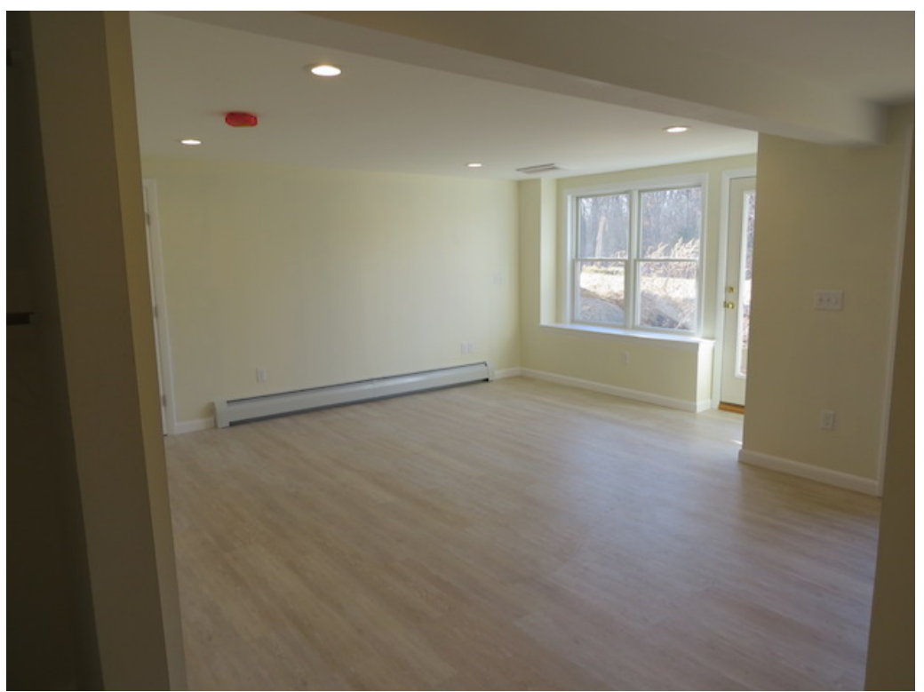
Living Room facing southwest.