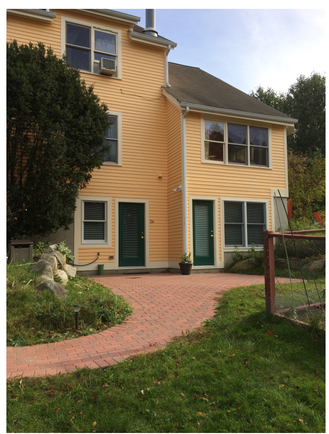
The house with apartment and patio on ground floor.