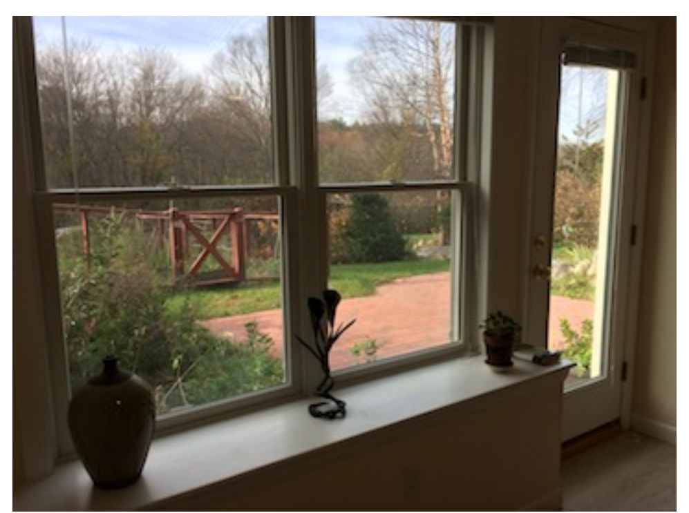
View out living room windows.